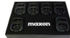
6 Cup Dual Slot Gang Charger - Radio/Battery & Battery