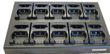
10 Cup Dual Slot Gang Charger - Radio/Battery & Battery