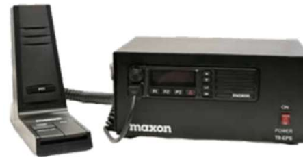
Base station set-up w/MDM-4000