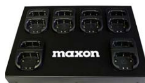
6 Unit Gang Charger/ Dual Slot Radio/Battery & Battery only