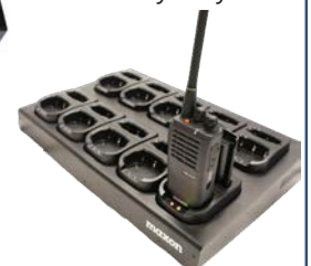
10 Unit Gang Charger/Dual Slot Radio/Battery & Battery only