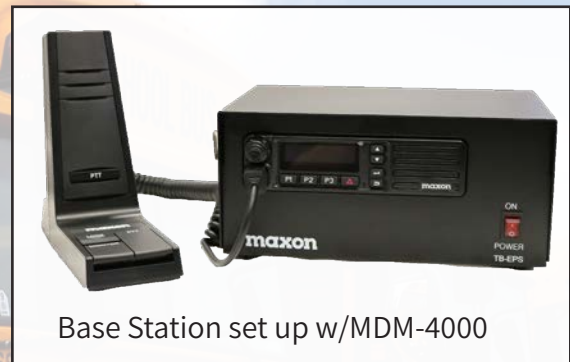
Base Station set up w/MDM-4000