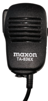
TA-836X Standard Speaker Mic

Maxon Speaker Microphones are the perfect tools to accompany your Maxon two-way radio. Adding this accessory will allow for easier access while continuing to provide high quality audio performance for your radio.