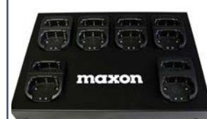
6 Unit Gang Charger/ Dual Slot Radio/Battery & Battery only