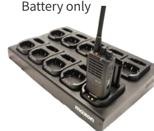
10 Unit Gang Charger/Dual Slot - Radio/Battery & Battery only