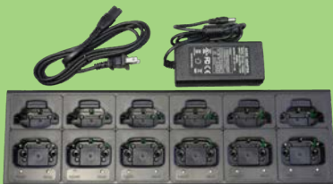
6+6 Dual Slot Charger Radio/Battery & Battery only