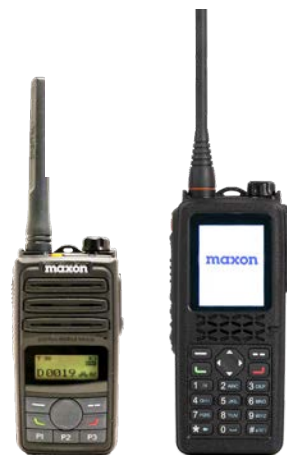
Control Volume w/ MDP-6424 & MDP-7424