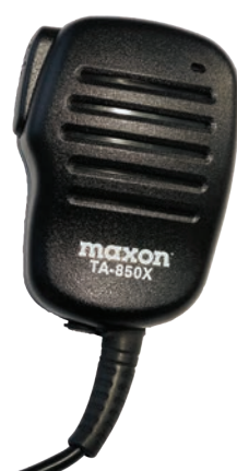
TA-850X Heavy Duty Speaker Mic