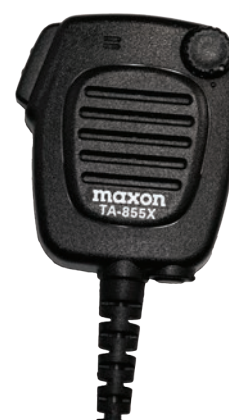
TA-855X Heavy Duty Speaker Mic With Hi/Lo Vol Control