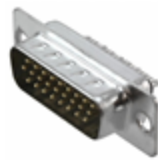
A-HDS 26 LL/Z AE11040-ND CONN D-SUB HD PLUG 26POS